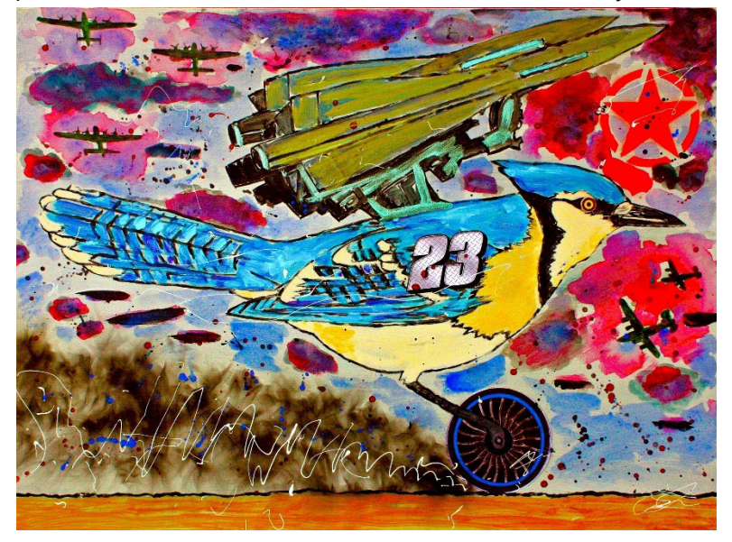
Bluejay, 2016

Today, the longstanding relationship between birds and the military continues through the Army Ornithological Society (AOS), an organization for members of the British Army, including ex-Army personnel, who have a special interest in birds and participate in birdwatching, assisting with overseas and UK-wide bird expeditions and surveys. Similarly, birdwatching and the study of military history are integrally linked in an annual "Birding the Battlefields" bird count at Civil War parks in the United States. Further, in 2015, Germany made the decision to turn more than sixty