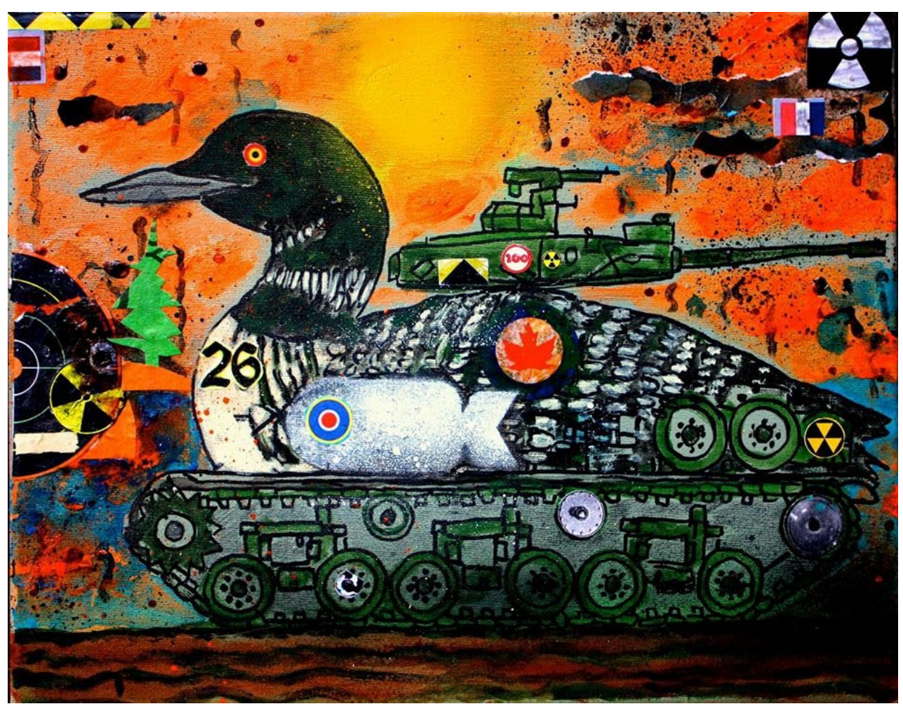
Canadian Loon, 2016 ©Terry Graff

The avian world has long inspired various military tactics, including the use of deception with camouflage and decoys, which can be traced to the sport of duck hunting. Just as wooden or plastic replications of waterfowl are used to trap ducks, the military has employed low-cost decoys