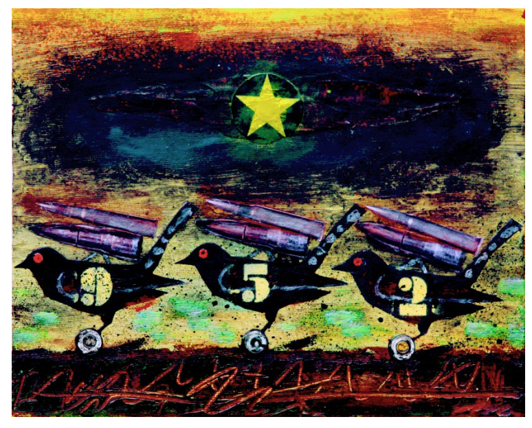
Bomb Squad, 2018 ©Terry Graff

of geese, having recognized how it gives each bird an unobstructed field of vision, allowing them to see each other and to communicate while in flight. More recently, for the purpose of gaining combat advantages by enhancing military navigation, army-funded research has been directed at learning how birds detect the Earth's magnetic