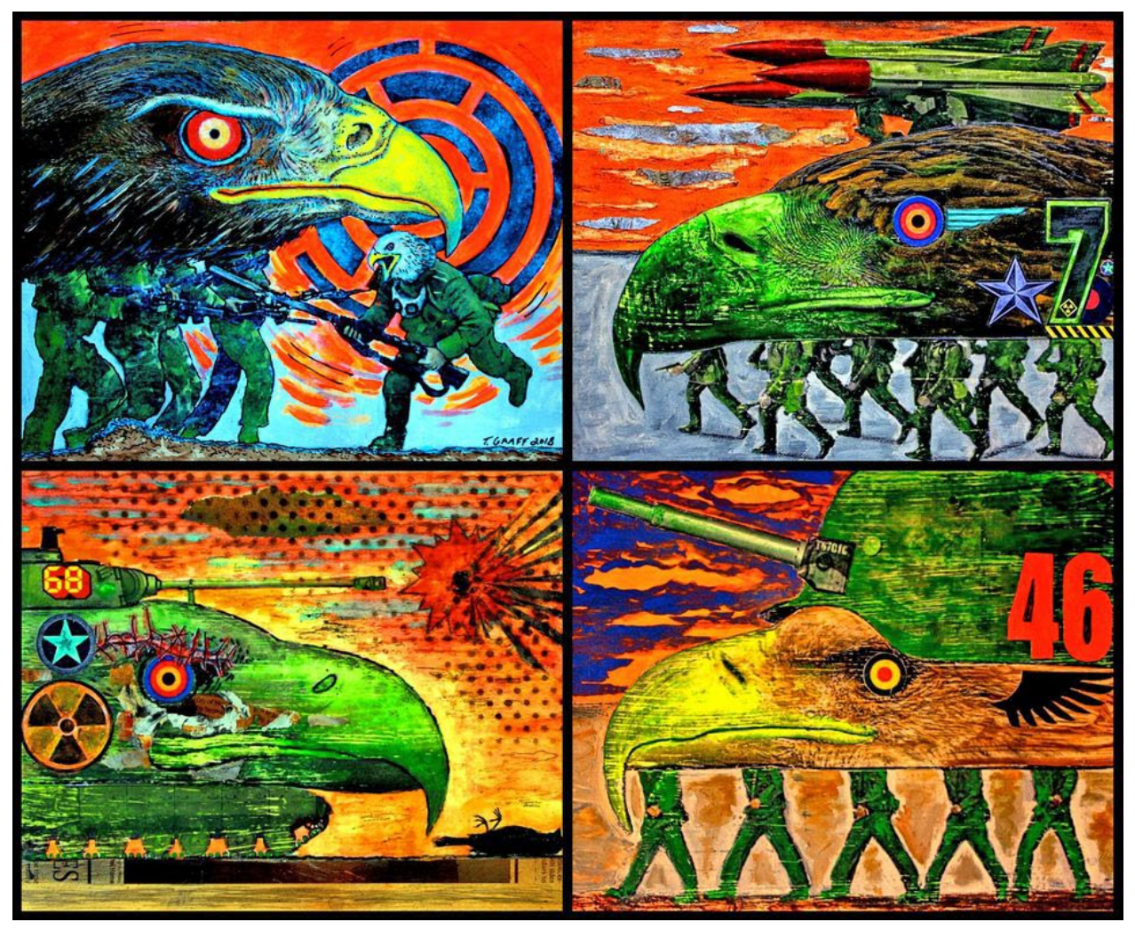
Four Trojan Warbirds, 2018 ©Terry Graff

For British military officers, it was standard practice to study, sketch and collect bird specimens as an important part of surveying, mapping and surveillance operations essential for acquiring geographical awareness for military campaigning, war and imperial domination. The Military Macaw, a species of parrot, received its name when military personnel imported the birds into Europe, and the word "sniper" was coined in the 1770s by British soldiers in India who hunted