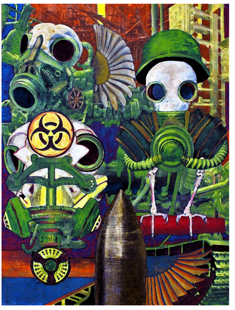
Brave New World, 2020 ©Terry Graff

telling us that we must cease our relentless war on nature, that the world's nations need to come together to invest in the restoration of Earth's landscapes, many of which have been destroyed by the destructive activities of war. We are at a 'now-or-never' tipping point, and if we do not heed this dire warning, more and more wars over resources are inevitable and both birds and humankind are most assuredly doomed to go the way of the dodo.