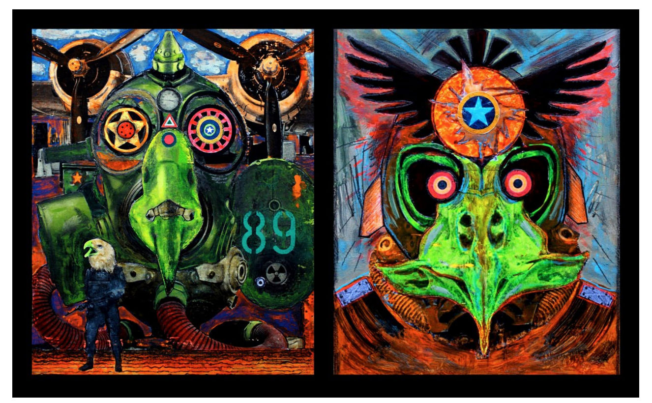
Warheads, 2019 ©Terry Graff

Other notable warriors in the bird kingdom include the Steamer Duck, which is known for its brutality, battling and killing other steamers and species in scrums lasting as long as twenty minutes; the Shrike, a predatory songbird that impales its prey, which includes snakes, rodents and