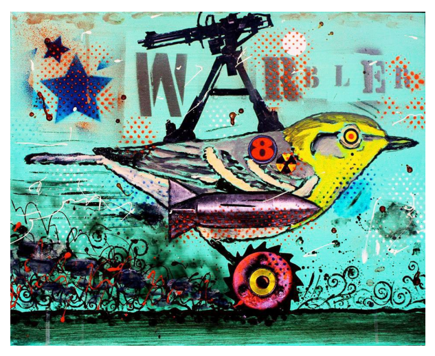
WAR-BLER, 2016 ©Terry Graff

endearing, but many are fierce warriors with formidable fighting capabilities, especially when they defend their nest, or are bent on taking over another bird's nest site. During breeding season, male red-winged blackbirds become fiercely territorial. With red epaulets raised, they will not only attack larger birds perceived as nest predators, such as crows, hawks, egrets, herons,