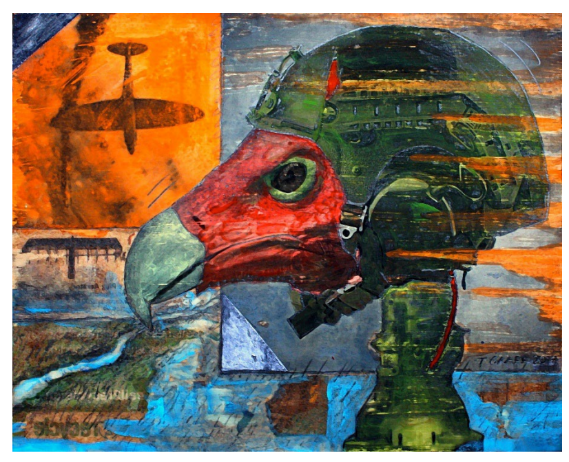
Buzzard, 2019 ©Terry Graff

A visually prominent connection between birds and the battlefield is the incorporation of bird feathers in the headgear and uniforms of armed forces across diverse cultures. The eagle-feather war bonnets of the First Peoples of the Great Plains were originally worn only by warriors who had