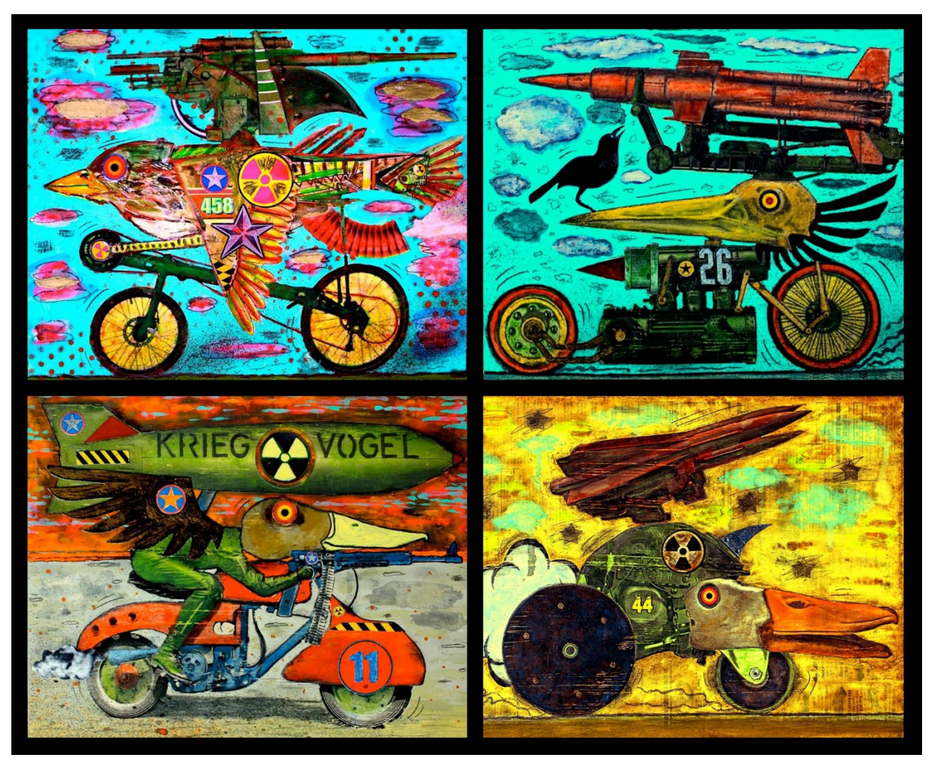
Warbirds on Wheels, 2018

Recent research into bird behaviour from the University of Bristol reveals that birds demonstrate solidarity in situations of conflict just as soldiers do when entering combat zones,