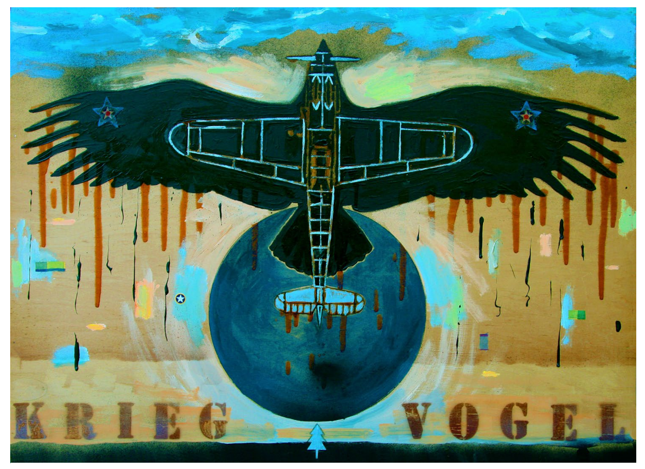
Wingspan, 2016 ©Terry Graff

symbols of imperial power by many of the world's great military empires, such as the myriad eagle