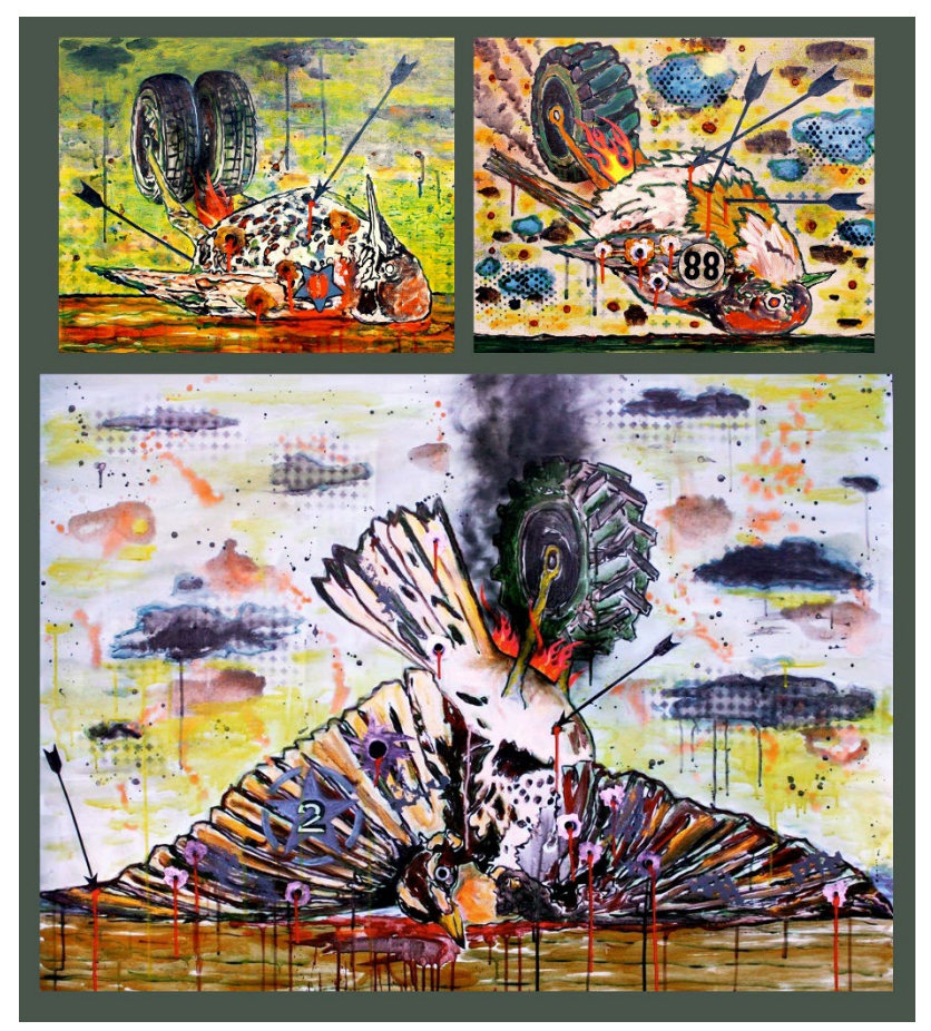
Saint Sebastian (three versions), 2016 ©Terry Graff

In more modern times, birds have been equipped with surveillance cameras for the purpose of spying on enemies, and have been used by the military to carry bombs or explosives or for suicide missions. In Qingdao, China, scientists are able to order pigeons to perform many complicated acts, such as turning right or left during flight, by attaching electrodes to their brain and applying electric stimulation controlled by computer programs. During World War II, the National Defense Research Committee invested in research by behaviorist B.F. Skinner for the development of a pigeon-controlled guided bomb. It was called "Project Pigeon" and involved